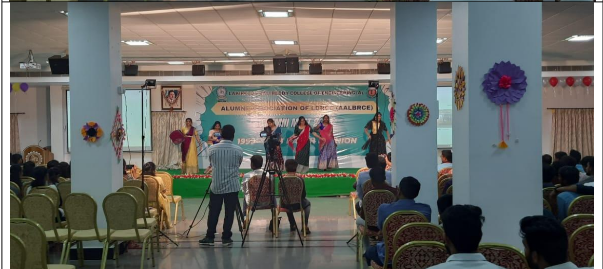
Students Participated in Cultural events organized by KRUTHI fine arts Cultural Club